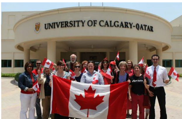
UCQ on Canada Day

Let's hear some of her responses to the interview questions: