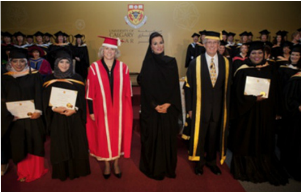
Under the Patronage of her Highness Sheikha Moza Bint Nasser, the University of Calgary – Qatar celebrates Bachelor of Nursing Graduates.

population, except in invited or special events. However, they are very proud and enjoy helping you learn their traditions when the opportunity presents itself. Because it is a status driven society, white women are mostly treated well and with respect, especially in social situations. In work situations, you might find more of an attitude of male dominance than you would in Canada, depending on the organization. This didn't affect me at the work place because I basically worked with Canadians from across Canada. The university also hired local staff from India, Philippines, Sri Lanka, etc. that brought a wonderful flavour of diversity to our campus."